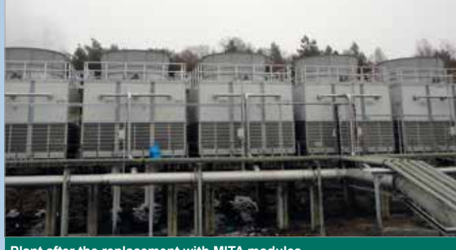
Plant after the replacement with MITA modules